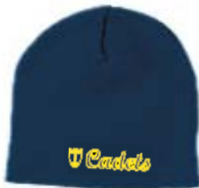
KNIT BEANIE CAP

Polyester mesh cap. Adjustable. Navy with Cadet shield embroidered logo. One size fits all.