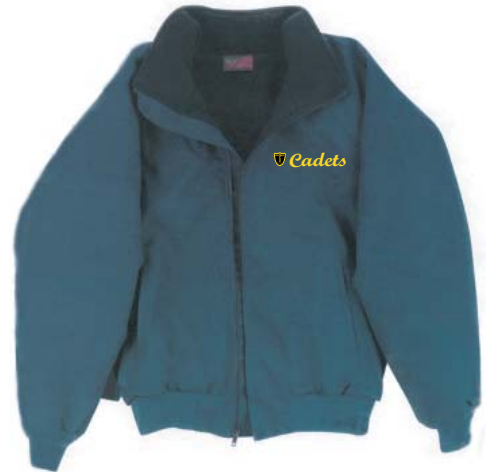
FLEECE LINED NYLON JACKET

Zip front, zip through collar with raglan sleeves, knit cuffs and knit waistband. Fleece lined outer pockets, inside pocket. Navy with Cadet shield embroidered logo.